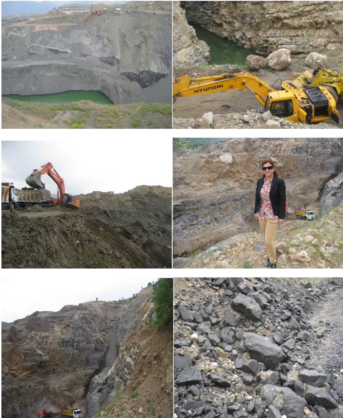
Figure 2. Dump stock sites for wall rock clay in Sirnak

Pictures from the open cast mining activities in Sirnak Region can be seen in figure 1 while the figure 2 shows the dump sites for wall rock clay in Sirnak.