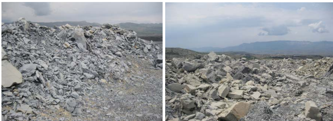
Figure 1 Sırnak open cast mining and obtaining clay samples

The asphalt mining in Sırnak Region is generally carried out by open cast mining method and the manufactured asphaltite are minced at Crushing – Screening facilities before putting on sale. On the other hand, the wall rock clay, produced during the manufacturing process is collected from dump sites in various sizes. In this study, whether the general purpose wall rock clay samples, obtained from the Avgamasya, Seridahli and Segürük asphaltite mines, which are some of the important asphaltite veins, active in Sırnak Region, have any area of utilization in Cement Industry or not was analyzed. General samples were collected from the aforementioned mining pits in compliance with the Sample Collection Methods and the SQX analysis was conducted in Anatolian University Ceramic Research Center Eskisehir.